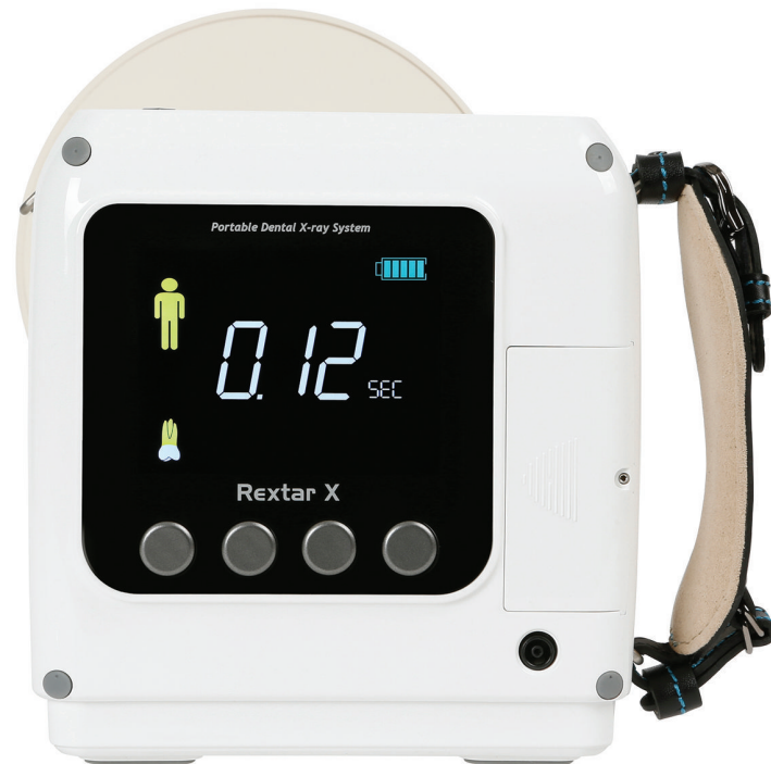
Largest LCD Display Screen