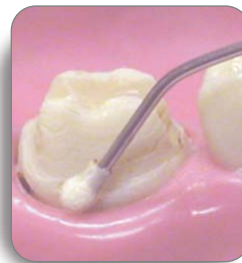
SofNeedle Tip accurately treats dentin without harming soft tissue.