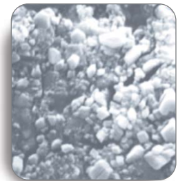
Dentin after treatment with D/Sense Crystal.