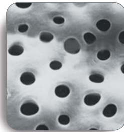
Dentin before treatment with D/Sense Crystal.