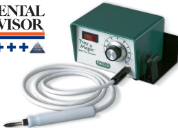
Tray Magic™ Soft Tray Trimmer Not available in Canada.

premier® Inspired solutions for daily dentistry®